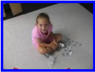
Eman helps assemble!