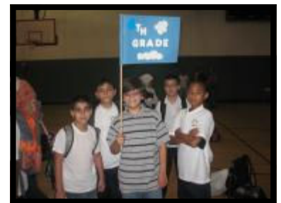
The 6th Grade boys!