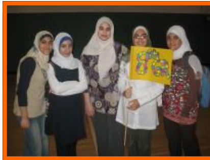
The 8th Grade Girls!