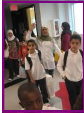
Students enter the new building for the first time!